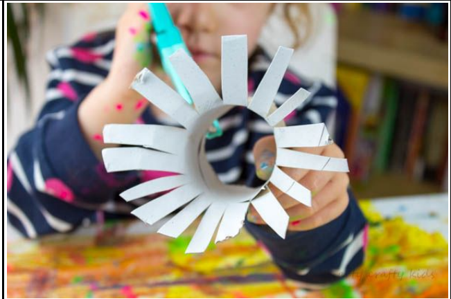
4. Print onto a large piece of paper. Repeat with different colours.